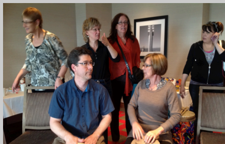
YTC Rehabilitation Team