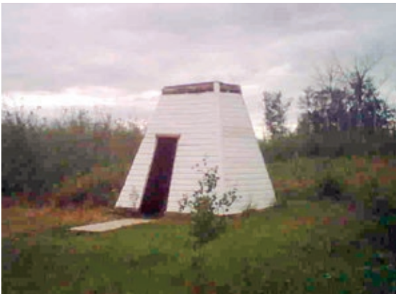
MODERN DAY SMOKEHOUSE

Each person who smokes meat or fish has his or her own way of making a smoke house. Generally, wooden poles and rails are made from various kinds of trees available in the area. These are used to build the frame and the racks. The smoke house is usually built in a teepee shape. A fire is built underneath the frame. The type of wood used for the fire depends on the desired flavour of the meat or fish. For example, resin tars in soft wood such as pine, may produce “off” flavours. The wood selected must make good smoke when burned. Strips of meat or fish are then hung from the rails above the fire. The frame of the smokehouse is usually covered to protect it from wind so the smoke will rise to the meat. Traditionally, animal hides were used to cover the frame but today canvases or tarps are also used.